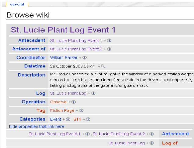
Figure 7 Example SMW browsing UI for an event's wiki page

We also used the "semantic query" to help users dynamically link to other pages. Figure 8 shows a table generated by semantic query listing the details (with many links) of events in the transaction log owned by "St. Lucie Plant". Here, a semantic query functions like a simple SQL query. Similarly, we can list events related to a policy by querying the policy's pattern, e.g. "list events whose coordinator is a US government agency".